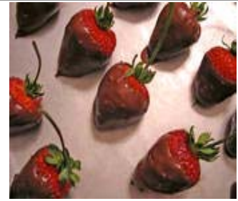
Hand Dipped Chocolate Strawberries