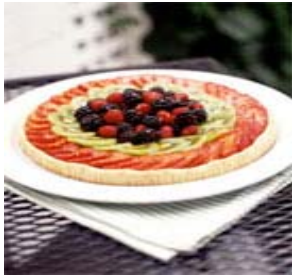
Mixed Berry Tart