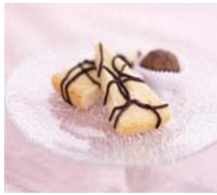
Chocolate Dipped Shortbread